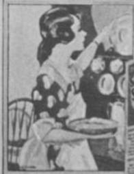
Wash dishes the new scientific way—with Super Suds. Glistens and silvers gleam. China needs no washing.