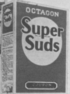
No waste—no undissolved soap—no chance of soap spots or film on dishes. Super Suds is perfect for washing machines too.

The BIGGEST box of soap on the market for 10¢